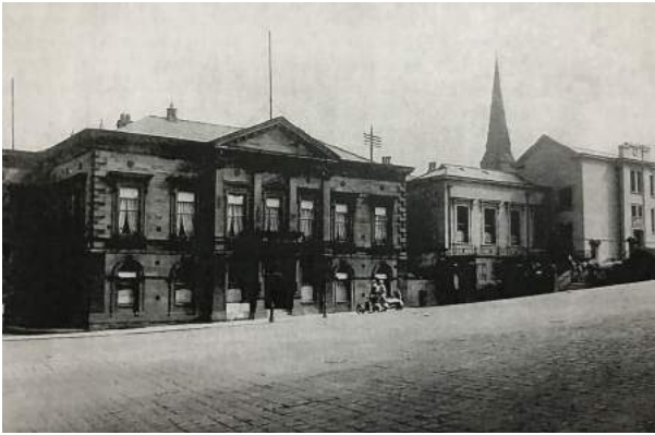
Town Hall and Police Station taken 1927