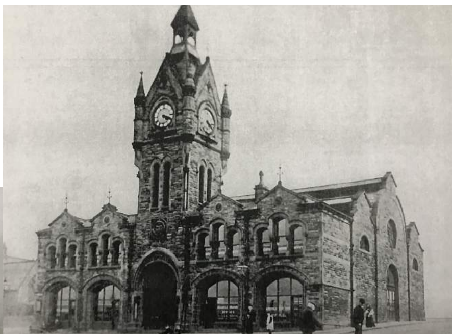
Market Hall taken circa 1890

The Post Office (part of the parade of shops) was opened in 1906 and extended in 1927 to accommodate the telephone