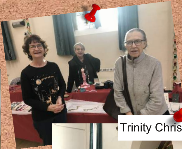
Trinity Christmas Fair