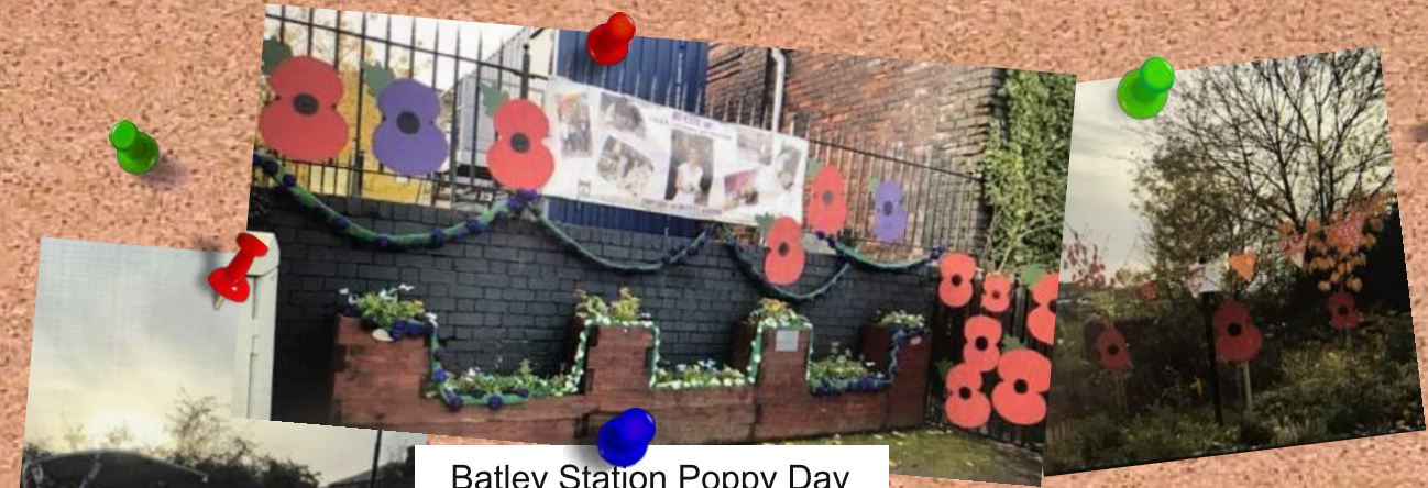
Batley Station Poppy Day