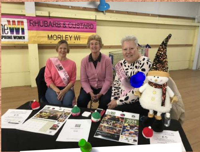
Tesco Craft Fair Morley WI