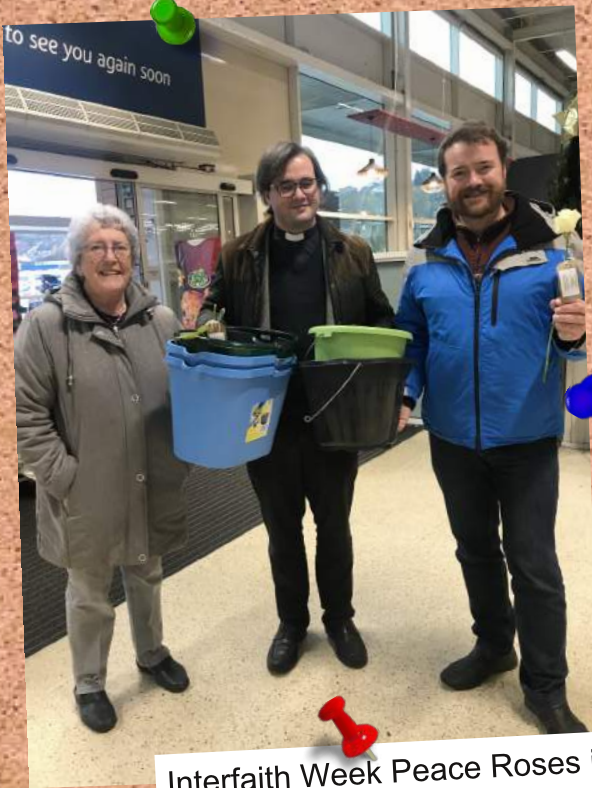
Interfaith Week Peace Roses in Tesco