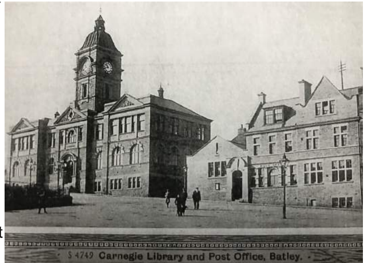
S 4749 Carnegie Library and Post Office, Batley. Library and Post Office taken circa 1910

Offices, Police Station and Court Room at a cost of £40,000. With sewers, new roads and tramway network costs they would have needed a big rate rise to pay so they decided to extend the present building. A fire damaged some of the building but the final re-build and extension cost £15,731 and was completed in 1905. An entrance was created onto the market square. In 1919 it was described as having "a fine Council Chamber, Mayor's Parlour, large Assembly Hall and Court House". The accommodation for various committees and staff was insufficient so in 1918, a block of adjacent property was bought. In 1960 the entrance onto Commercial Street was blocked. The Town Hall is Grade 2 listed.