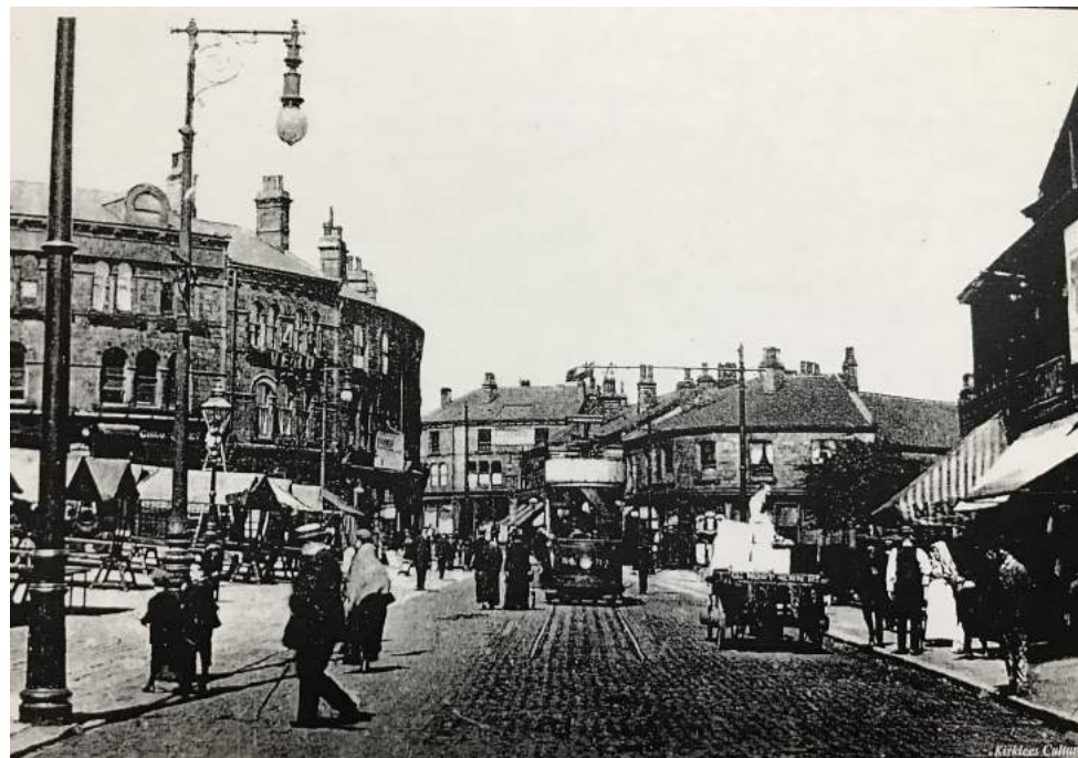
Bottom of Market Square taken circa 1905

The police Station with a special house for the inspector in charge was built and opened in 1927 and this completed the buildings round the square.