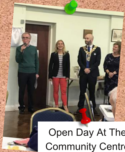
Open Day At The Community Centre

BECOME A CONTRIBUTOR. Do you want to celebrate the good news stories and amazing people in Batley? Email togetherinbatley@gmail.com to find out the details