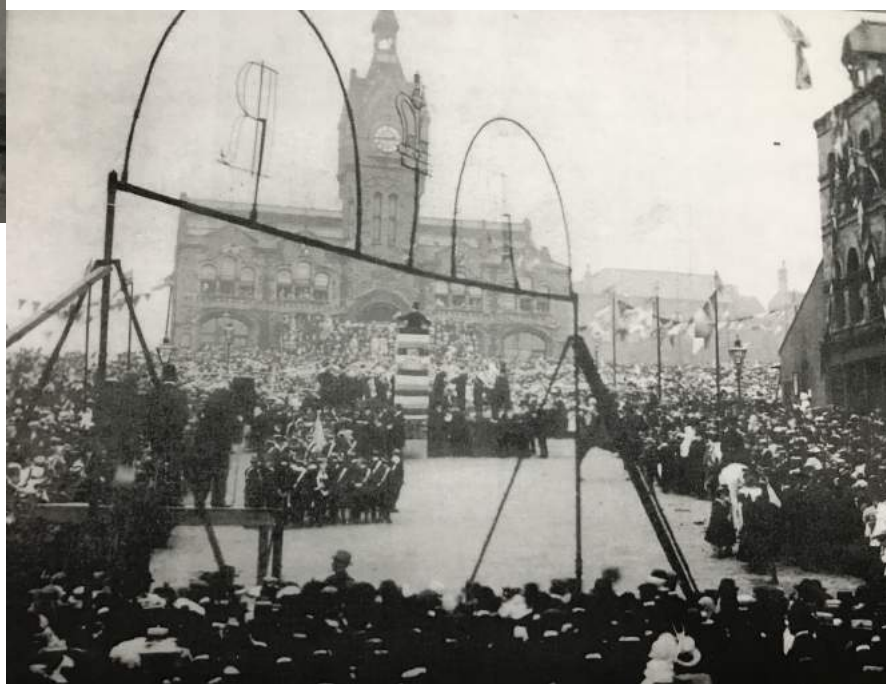
Market Square taken 1902

In 1868 the corporation passed an act to build a proper Market Hall at the head of the market square. The Hall was opened in 1878 housing 28 stalls, 6 butcher's shops, borough surveyors office and a weights and measures department. It was too small and so was demolished within 20 years. The tower was left standing until the town clock could be