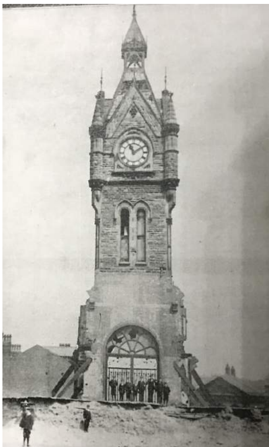
Market Clock taken 1905-1907

In 1868 Batley Council was established with 18 councillors and 6 aldermen. A 99-year lease was negotiated with the Akroyd Trustees for the corn field on Commercial Street and a market soon flourished there. This encouraged the trust to sell or lease land round the field which led to the first shop being built